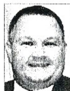
Hancock Bank Ford Favre