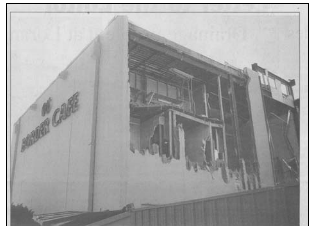
FRONT SIDE — An exterior wall at the front of the mall is being ripped down.