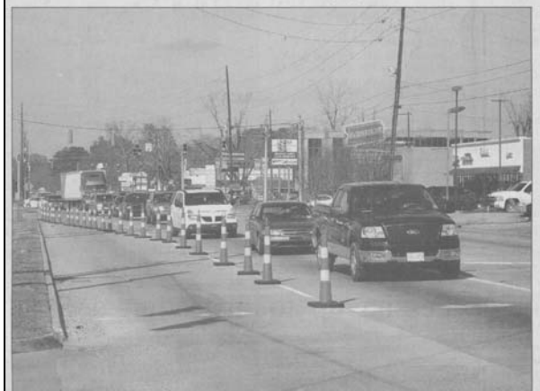
CONES IN FRONT OF MALL — U.S. 51 southbound merges into one lane near Hammond Square as major road renovations continue. Two turning lanes will be added for travelers to turn into the mall.